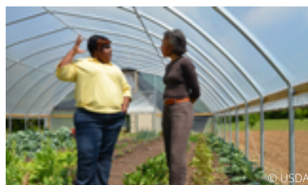
NATIONAL SUSTAINABLE AGRICULTURE COALITION